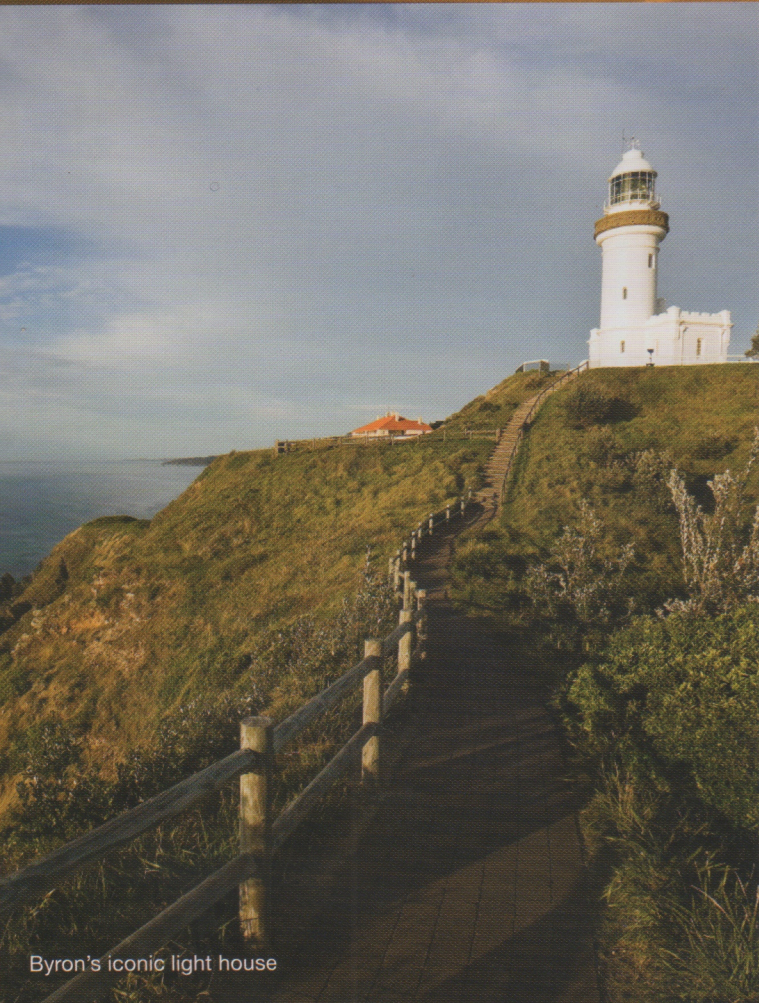
Byron's iconic light house

B yrone Bay did not have to do much extra to get popular. It was already blessed with some of the world's most beautiful beaches and countryside. Discovered by surfers and hippies in the 60's, this small country town on the east coast of Australia has gradually morphed into one of the world's premium travel destinations. Its origins as a working class meatworks and whaling town still shows through in the small amount of unrenovated architecture.