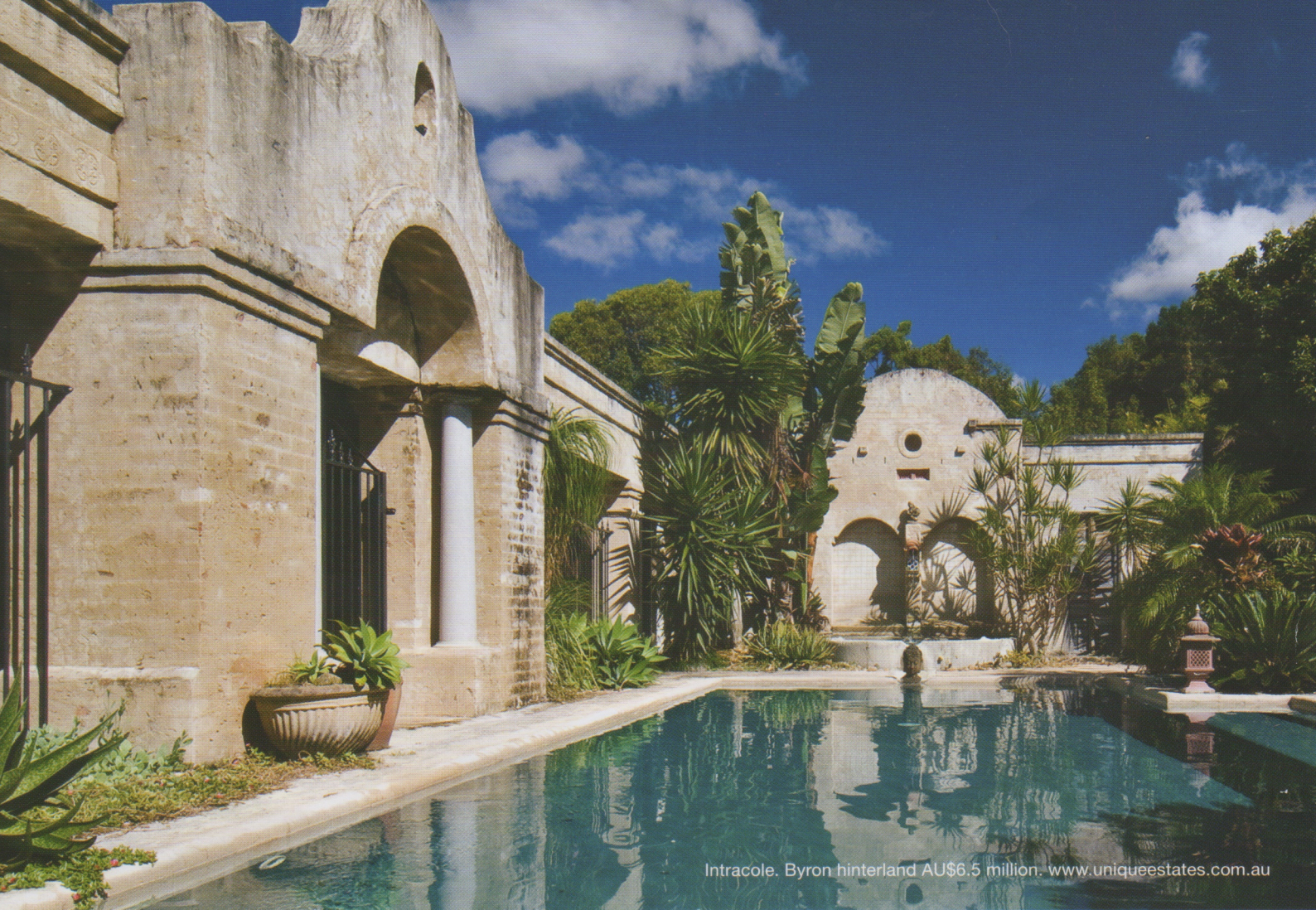
Intracole. Byron hinterland AU$6.5 million. www.uniqueestates.com.au