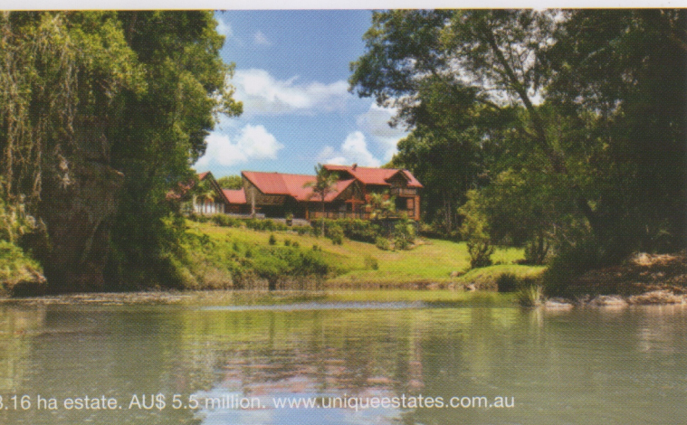
0.16 ha estate. AU$ 5.5 million. www.uniqueestates.com.au